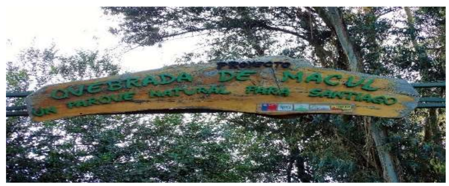
DAY 2 SCHOOL / QUEBRADA DE MACUL

We will leave early from school to take the Quebrada de Macul trail to reach milestone 3 of this hike. We will strengthen the non-trace workshops as well as the trekking workshops. Back to school