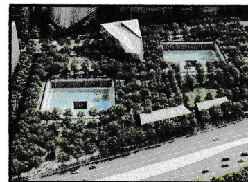
The 9-11 Memorial

Shopping Time in Midtown, Times Square, and Rockefeller Center!