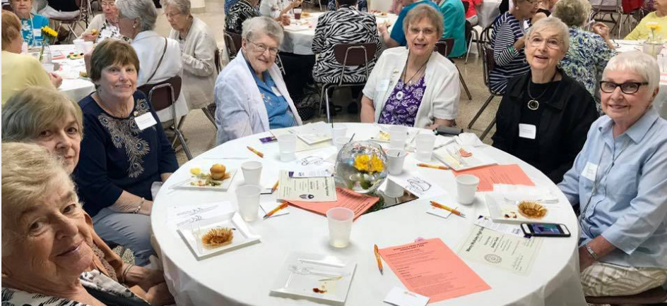
A group shot of the 2019 Golden Guild. Alumnae who graduated 50 or more years ago joined us for a Prayer Service and Brunch on June 1. To see more photos, visit mercymcauley.org/alumnae/news/e-news .

The McAuley Class of 1989 reunion will take place on October 12, 2019. Invitations are coming soon!