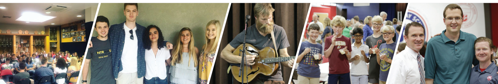
Young Alumni Panel