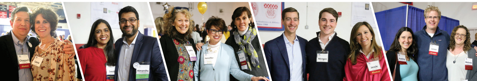
Share the Promise