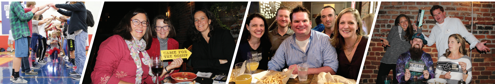
2018 Homecoming Recap