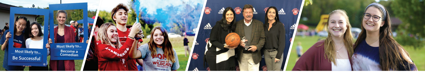
2018 Homecoming Recap