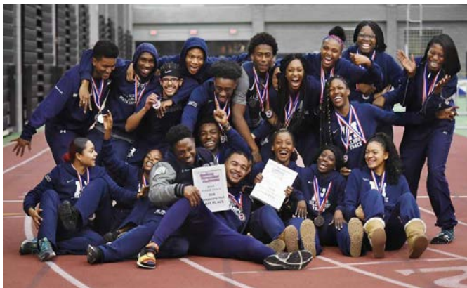
ACES High: The Hillhouse girls and boys indoor track teams won both the SCC and state titles in 2019.