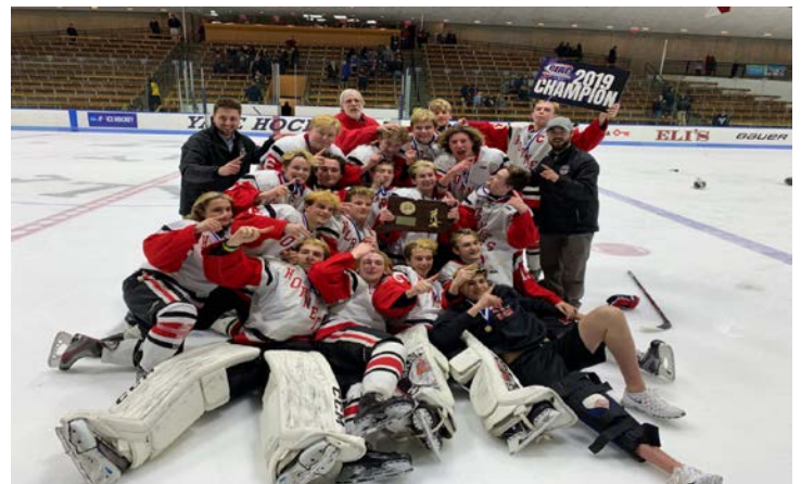
Keep Dreading the Red: Branford won the SCC/SWC and State Division II boys ice hockey titles in 2019 (Steady Photography photo).