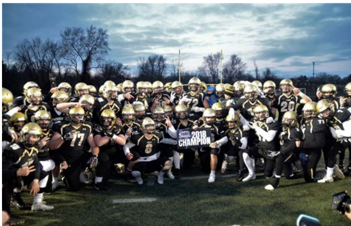
Tiger Tales: Daniel Hand football rolled through Class L on its way to its second straight state title. The Tigers outscored their three opponents, 159 to 21.

Sacred Heart Academy, Class M field hockey – lost to Guilford, 3-1 Cheshire, Class L field hockey – lost to Staples, 2-0 Guilford, Class L girls cross country North Haven, Class M girls swimming Lauralton Hall, Class S girls swimming Cheshire, State Open girls swimming