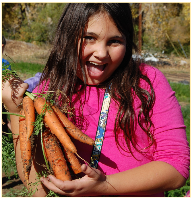
How does Farm-to-School programming help support the mission of the Boulder Valley School District?

While research evaluating the overall impact of Farm-to-School programming within school districts is in its preliminary stages, initial reports are finding that the implementation of Farm-to-School initiatives has had some measurable positive effects on students' dietary choices.<sup>1</sup> Other benefits include the community outreach and involvement that develops out of partnerships with local producers and schools, as well as parent involvement that may result from creating both formal and informal farm-to-school events and programs. Additionally, the programming gives teachers new, experience-based, inquiry-learning opportunities for delivering classroom content.<sup>2</sup>