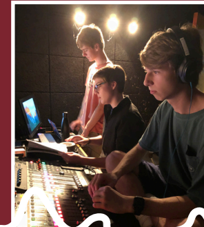
Theatrical and music performances