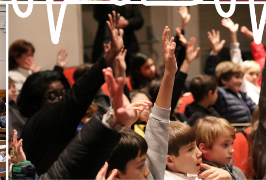
Student wellness programs