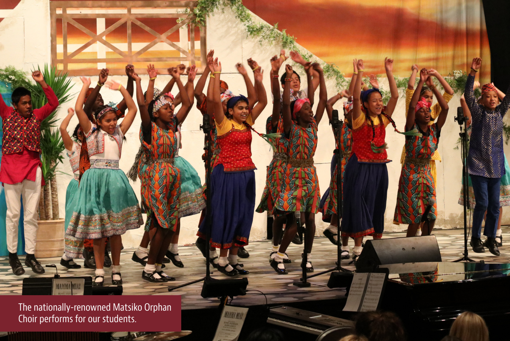
The nationally-renowned Matsiko Orphan Choir performs for our students.