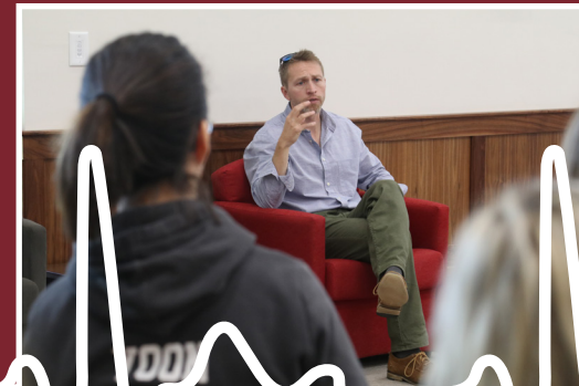
Visiting Writer Series