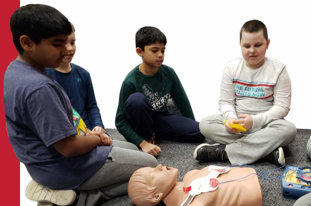
Students learning about first aid and how to use the AED machine