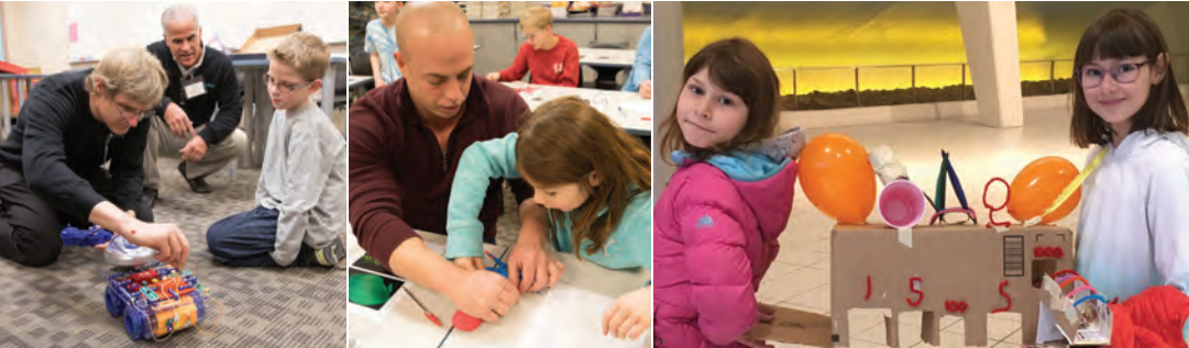
Examples of activities include Breakout EDU (a tabletop version of an escape room), programming robots like Ollies, cardboard arcade game challenges, and more!

At the annual STEAM Summit, District 95 families come and explore different STEAM based activities designed for students in grades 3-8. Exploration opportunities are hands-on and led by District 95 staff and community partners.