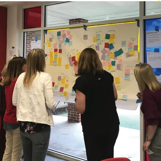
Gathering input from the faculty and staff