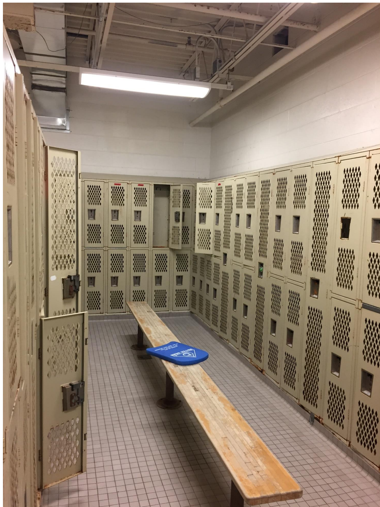
Men's Locker Room