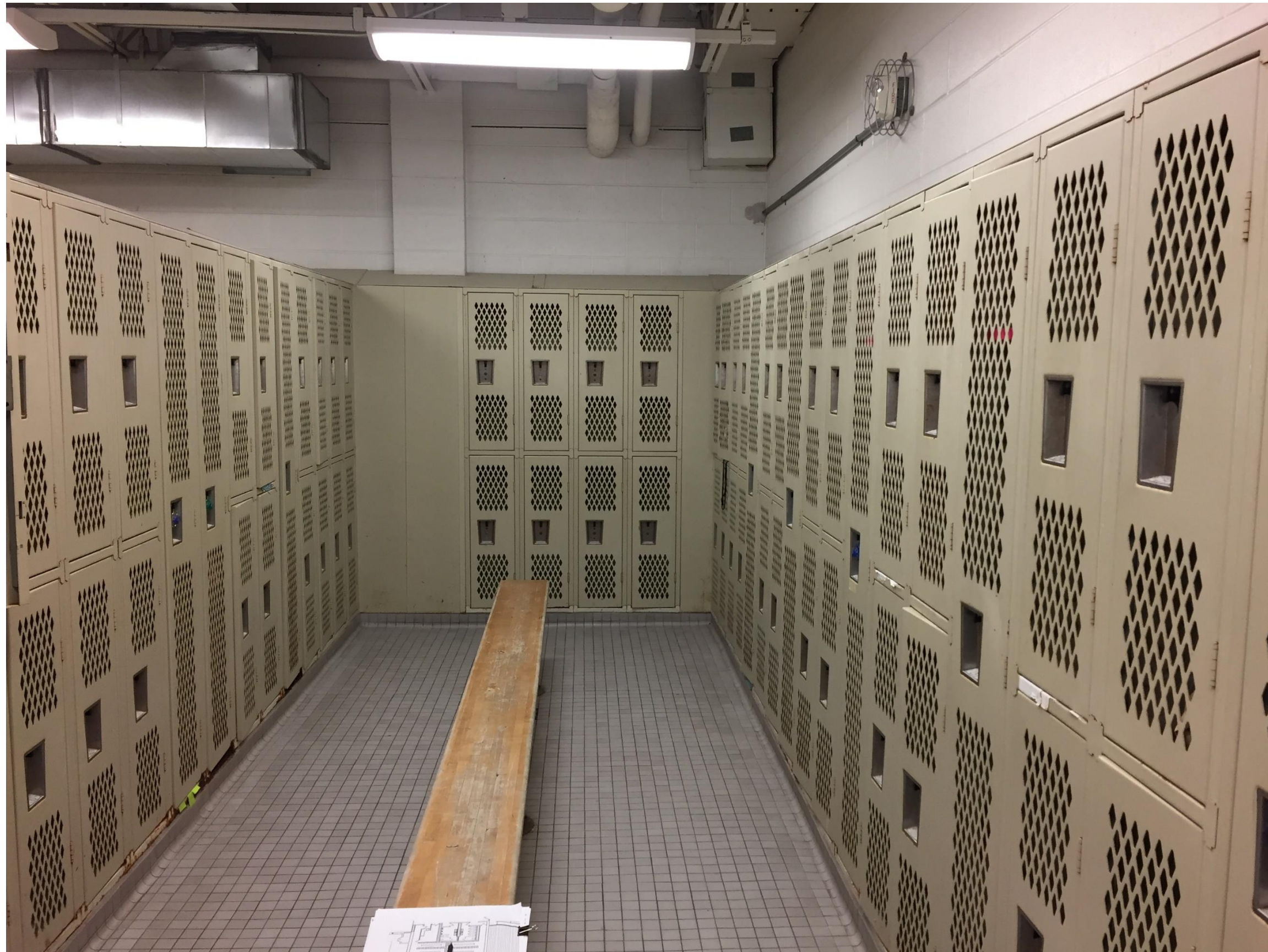
Women's Locker Room