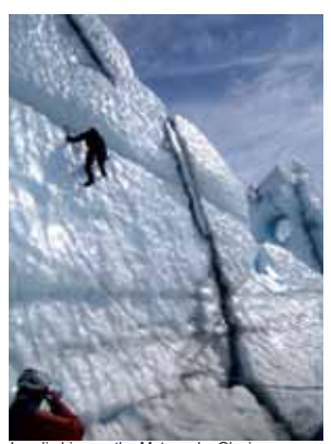
climbing on the Matanuska Glacie

AAVE is the acronym for All About Visiting Earth, a teen adventure company that allows kids between the