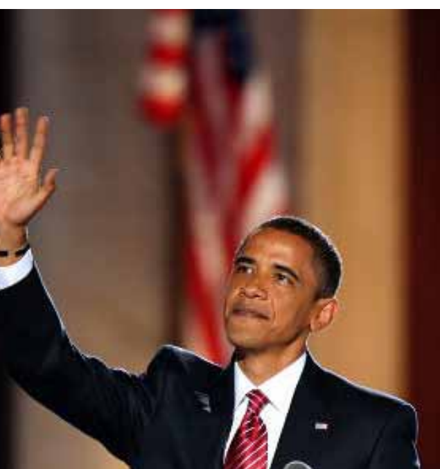
President-elect Barack Obama greets supporters at Grant Park

million voters cast their ballots, approximately 10 million more than had done so in 2004, which had broken all previous records. With an African-American in office, many who had taken part in the long struggle for civil rights were visibly moved. The world now sees that America truly is ready