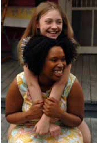
Dakota Fanning and Jennifer Hudson.

Courtesy of buzzsugar.com and played in 1,591 theaters. You can still go to see it in your nearest theater or even buy a copy of the book at your local book store. You may just learn an important lesson from both, anyone is capable of accomplishing anything just as long as you put your mind and heart into it.