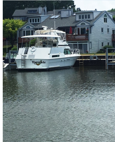
Cindy and Bruce Nelson preparing for a future sea voyage