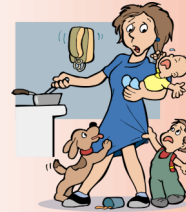
Kudos ! Too Many to List