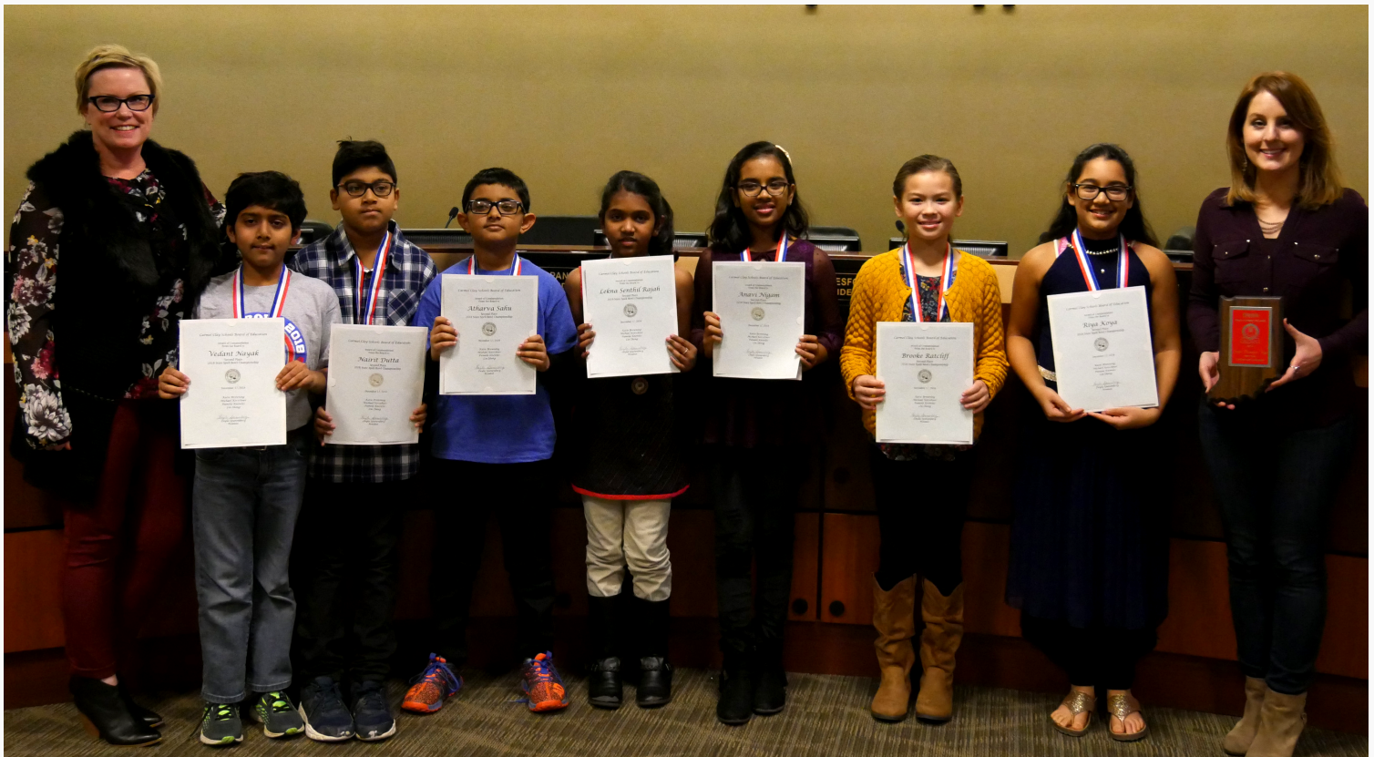
Carmel Clay School Board recognized the Orchard Park Elementary Spell Bowl Team for their second place finish at the State Spell Bowl Competition. Watch the Special Presentation