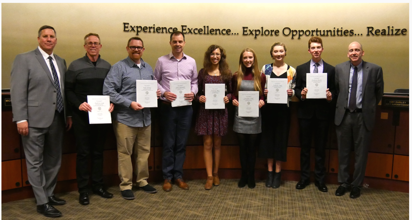
Carmel Clay School Board recognized the Carmel High School Marching Band for winning their 3rd consecutive Grand National Championship at the Bands of America Competition. The Marching Greyhounds were also recognized for winning the 2018 ISSMA State Competition.