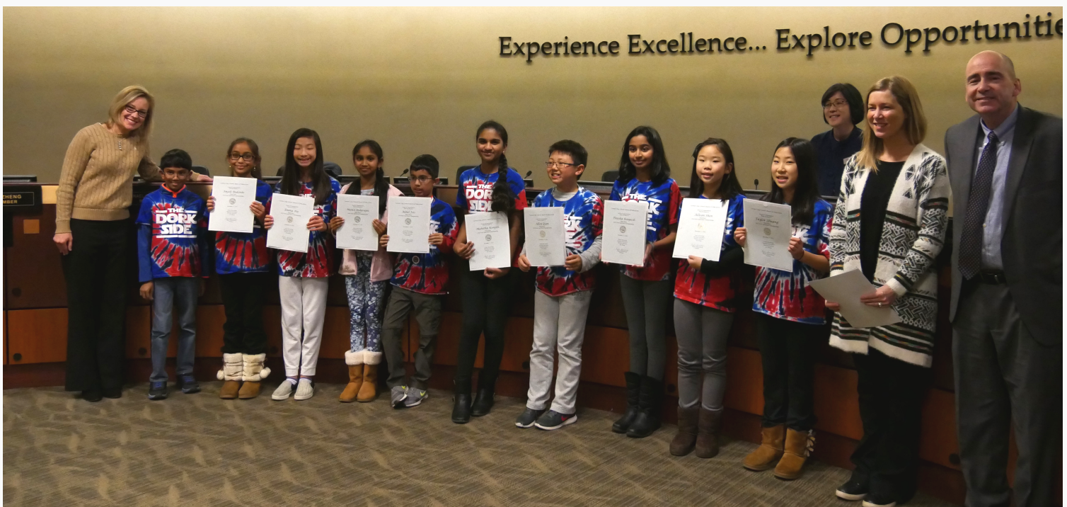
Carmel Clay School Board recognized the College Wood Elementary Spell Bowl Team for placing third at the State Spell Bowl Competition. Watch the Special Presentation