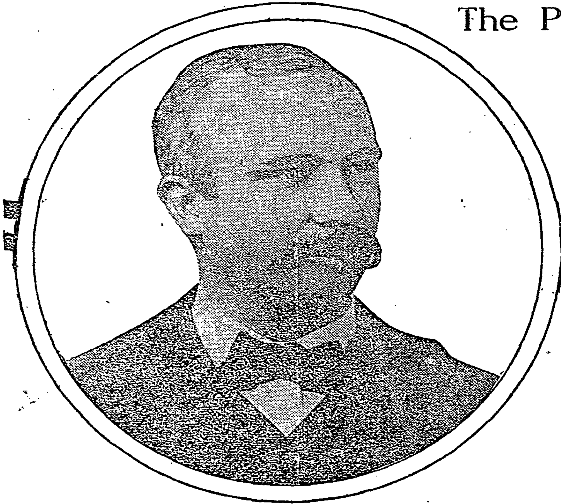
P. J. Maguire, the Founder of Labor Day.

The President of the American Federation of Labor Writes of the Meaning of National Holiday and How It Originated.