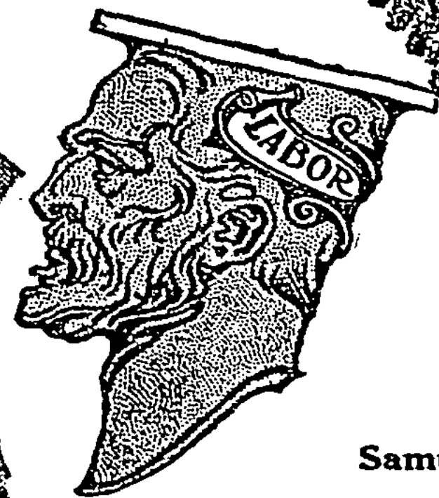
Samuel Gompers, President of the Federation of Labor.

unnecessarily cruel environments. The struggle is for home and fireside, for a higher life, a nobler manhood, womanhood, and childhood, which may look forward to the day of deliverance from absurd economic conditions and cruel burdens. The future will substitute the college and forum for the arsenal and jail; the home, and not the factory, for motherhood; the playground, school, and sunlight, and not the mill or workshop, for childhood.