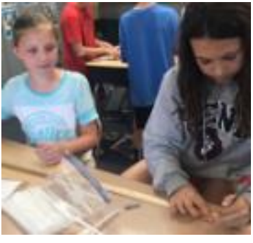
4<sup>th</sup> Grade scholars focus on their design and build activity.