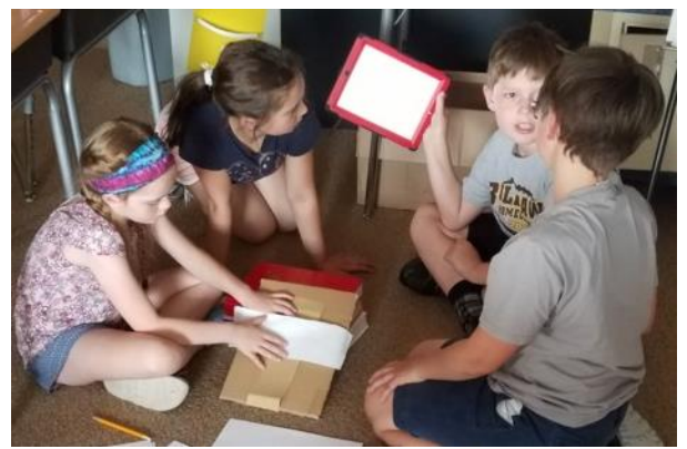
3<sup>rd</sup> Graders use an i-pad timer to measure how friction slows an object moving down a ramp.

Manoa came alive with scientists and engineers during STEM Week. Activities included an explosive assembly by Haverford High School Science Teachers, the Science Fair, and an engineering activity for every grade.