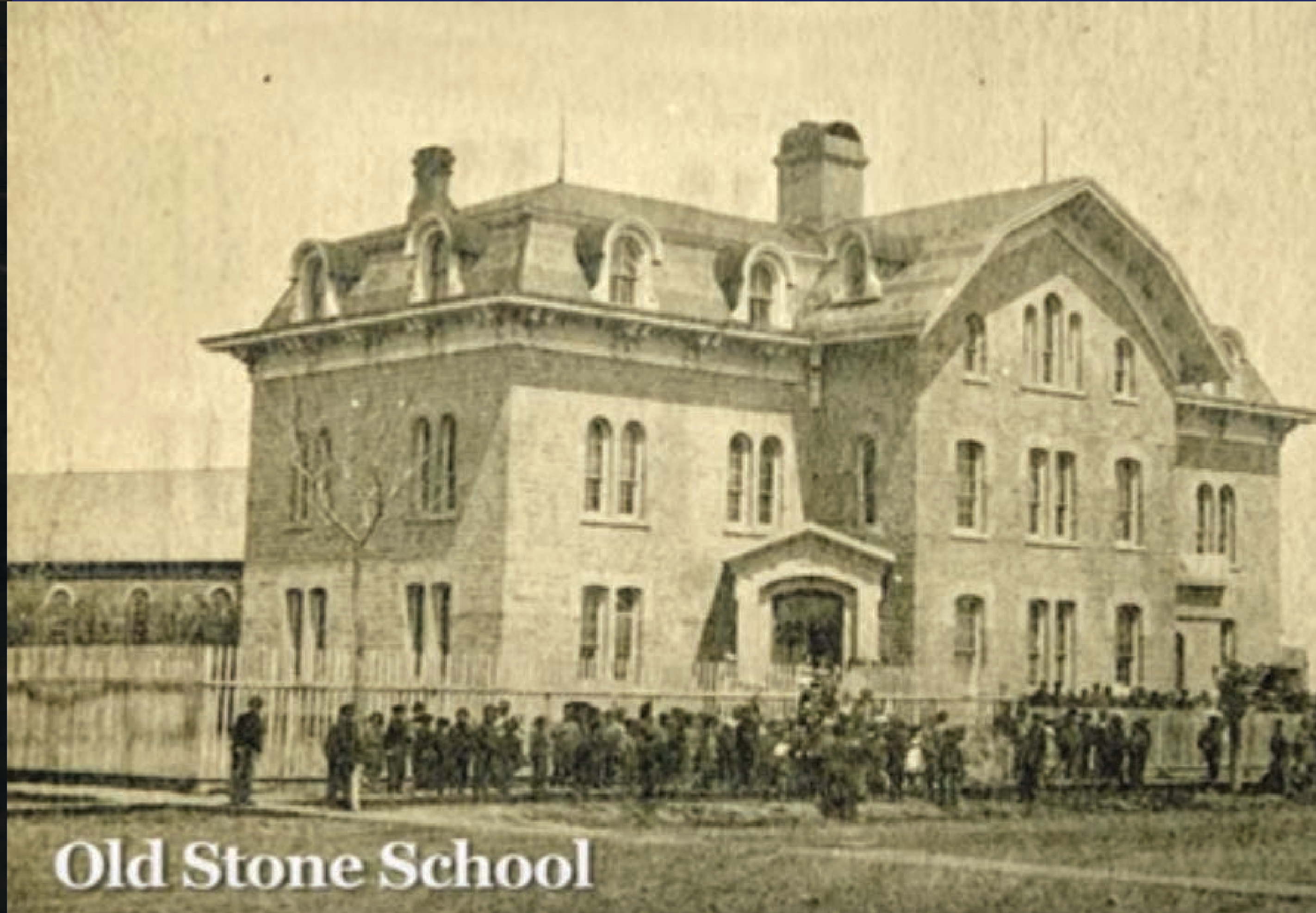
Old Stone School

1870 The first west-side high school class, comprised of 5 students, graduated.