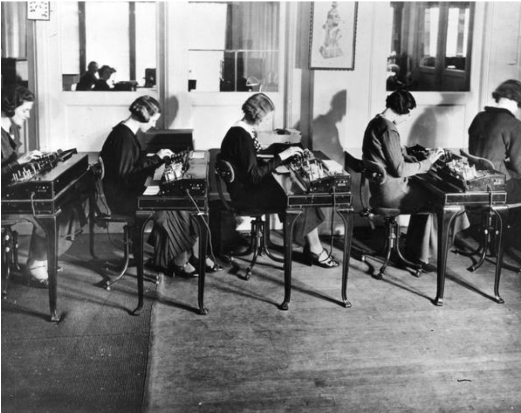
Keypunch operators at IBM in Stockholm in the 1930s.