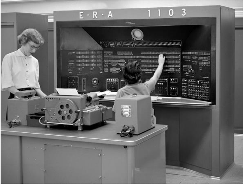
An E.R.A./Univac 1103 computer in the 1950s.

manager at the National Science Foundation. “There were all kinds of things signaling that if you don’t have the right genes, you’re not welcome.”