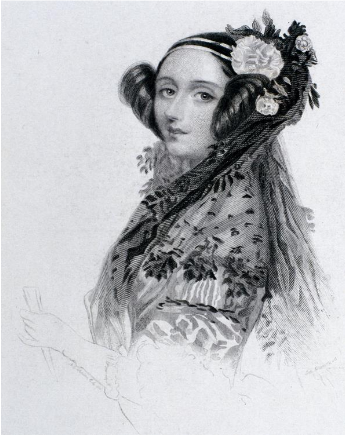
An engraving of Ada Lovelace, the first computer programmer.