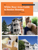
White Bear Area Guide to Senior Housing

Contact the department at 651-653-3121 to request printed copies of any of the following guides: