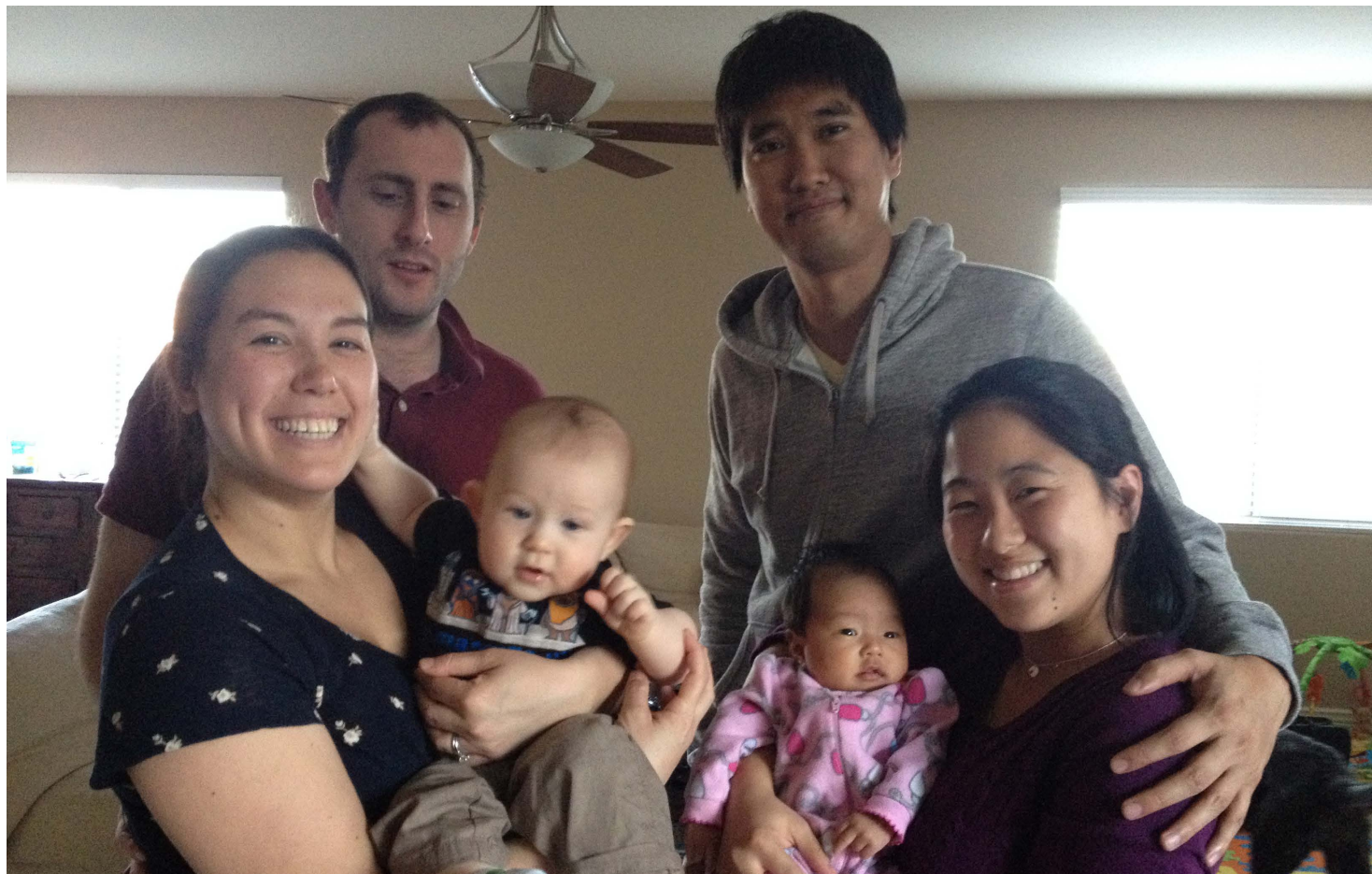
Above, Baby Dragons forming a network!