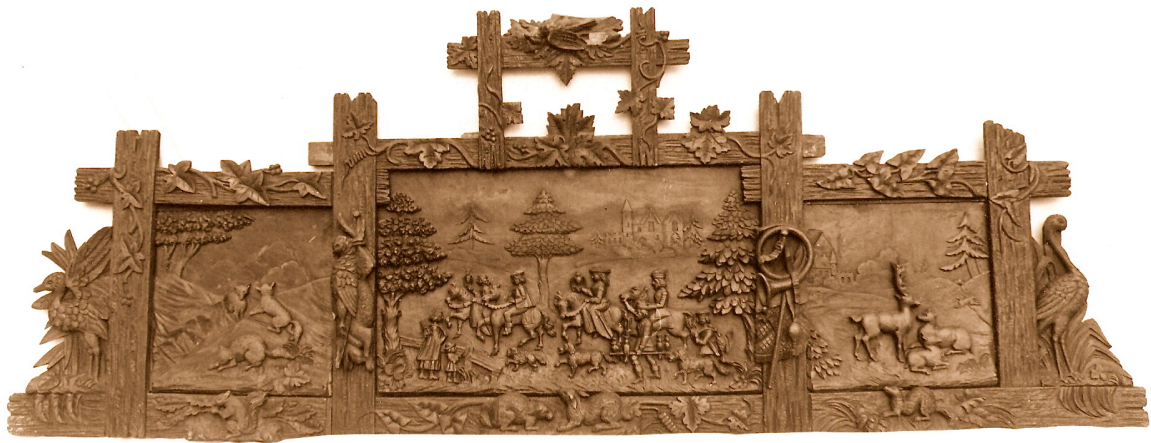
Wood over-mantle relief panel by Alfred Robinson, circa 1875