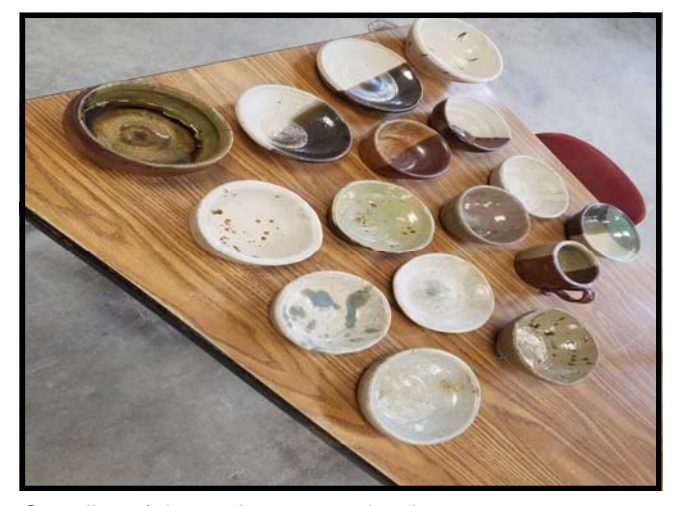
Sampling of donated stoneware bowls