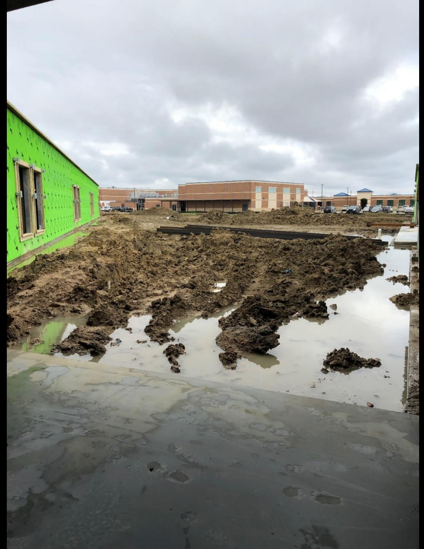
Area D Classroom Addition Exterior Framing & Sheathing