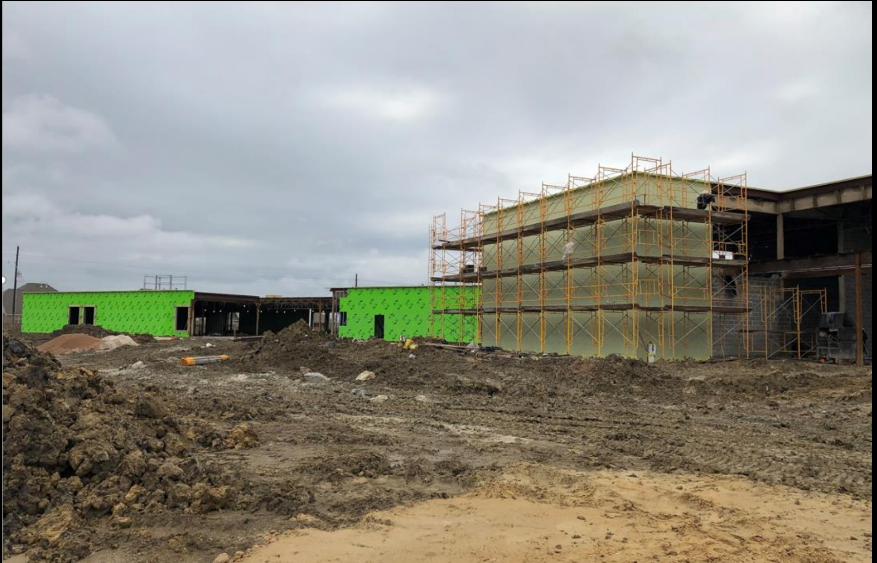
Exterior Building Envelope – Sheathing, Waterproofing, Window Blocking, Roof Blocking