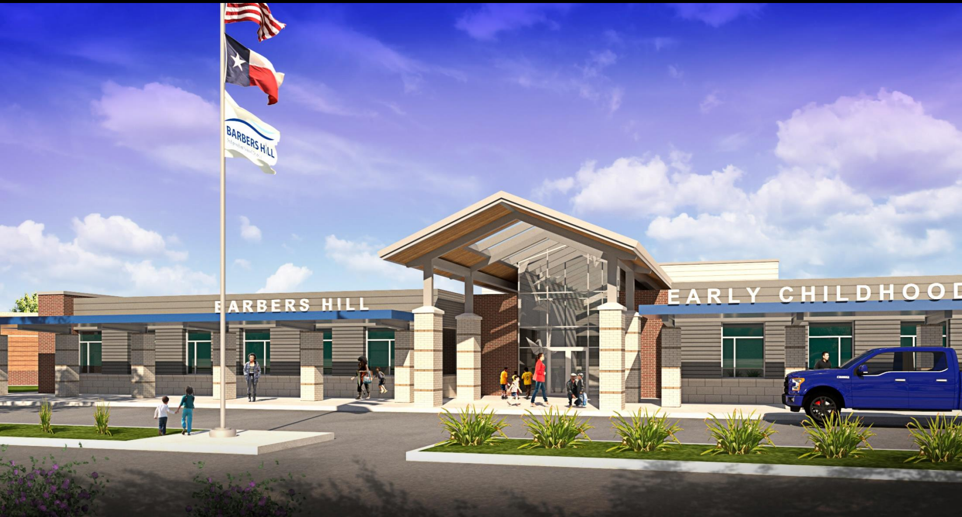
Early Childhood Center Front Entry Rendering