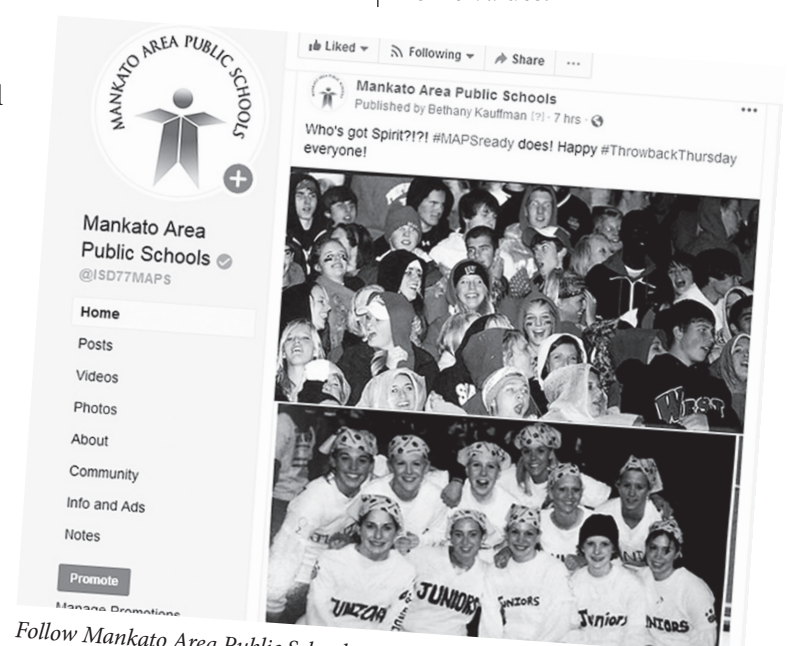
Follow Mankato Area Public Schools on Facebook, Twitter and Instagram.