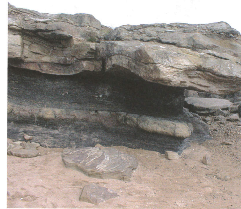
Figure 2 A cliff with different rock types in north-east England

Study Figure 2, a cliff with different rock types in north-east England.