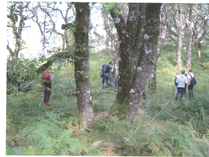
Figure 4 Students carrying out fieldwork in a woodland environment

Study Figure 4, a photograph of students carrying out fieldwork in a woodland environment.