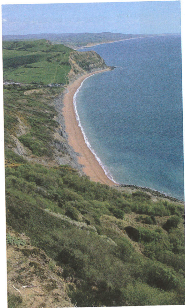
Figure 1a A stretch of UK coastline, with a beach

Study Figure 1a, a photograph of a stretch of coastline, and Figure 1b, a photograph of a rural upland area.