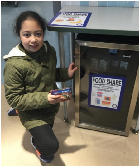
Our new share table and refrigerator