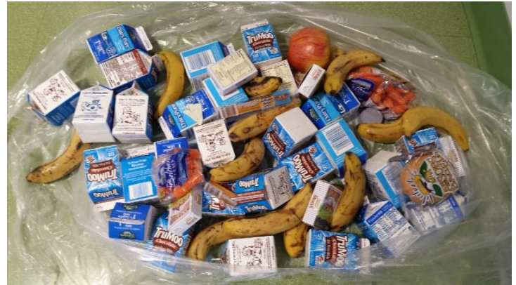
Remember this photo (above)?