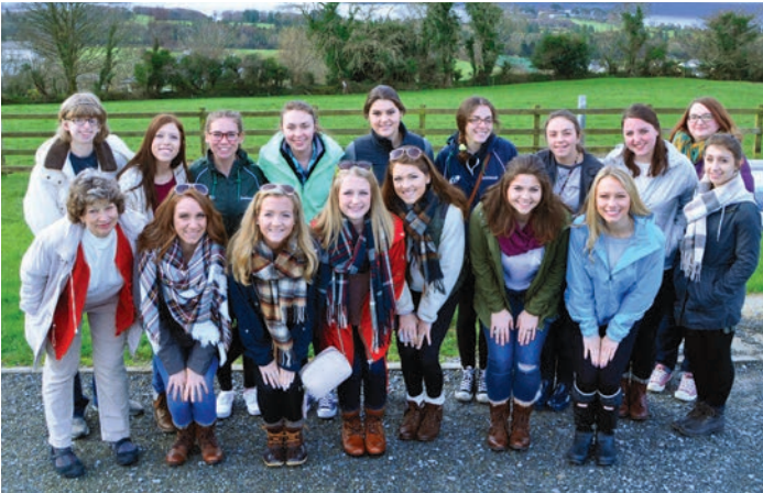
Resurrection sponsored student travel to Ireland during Spring Break 2016.