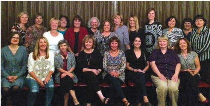
40 Year Reunion - Class of 1976 reunion on October 8, 2016