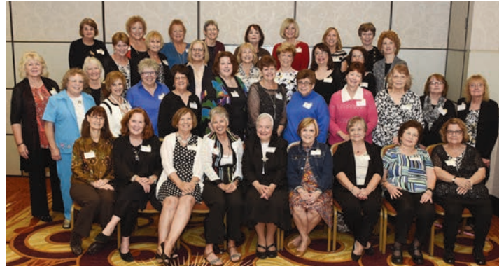
50 Year Reunion - Class of 1966 reunion on October 1, 2016