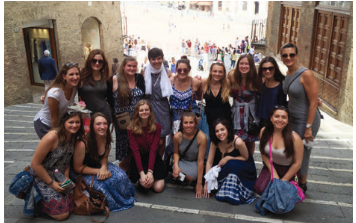
Resurrection sponsored student travel to Italy in June 2016.