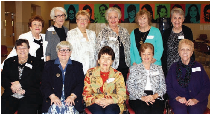
60 Year Reunion - Class of 1956 reunion on October 2, 2016