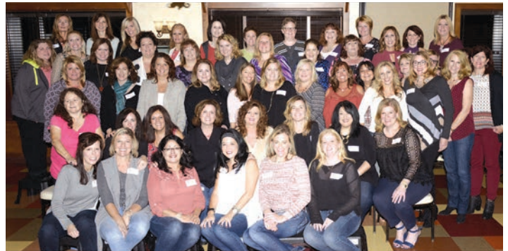
30 Year Reunion - Class of 1986 reunion on October 8, 2016