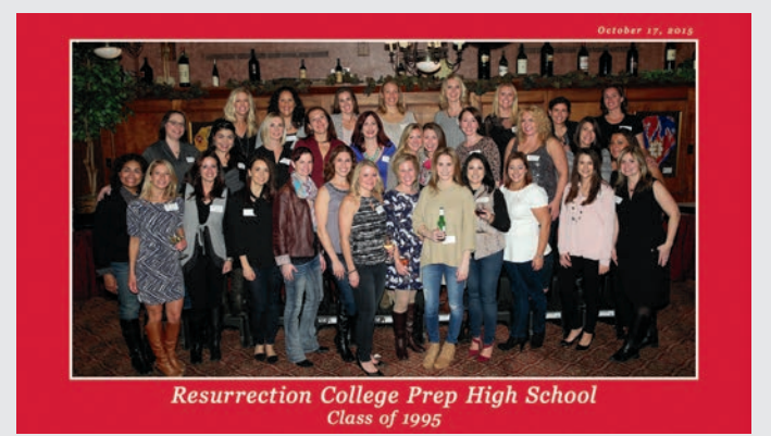
Class of 1995 20th Reunion on Saturday, October 17, 2015