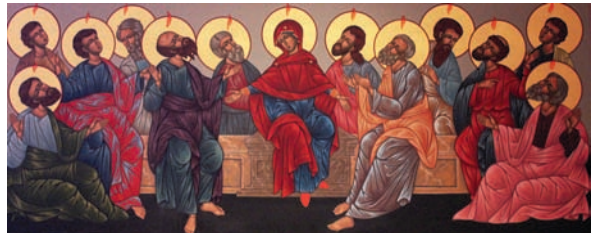
Artwork portraying Mary with red shoes hangs in the Resurrection chapel.