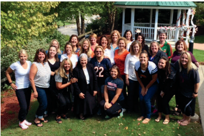
Alumnae participants at the September 20, 2015 golf outing.