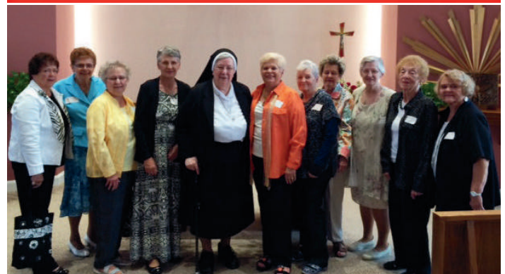
Class of 1955 Reunion