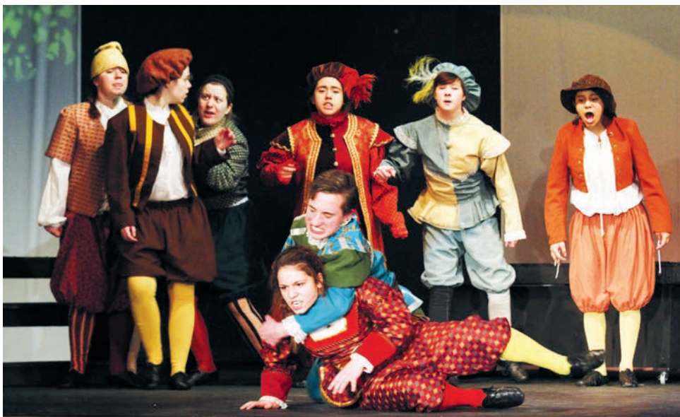
Shakespeare's Romeo & Juliet was the spring drama production and received rave reviews.