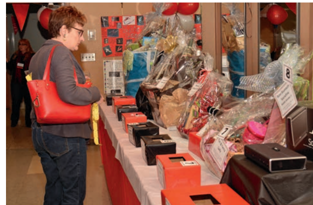
Basket raffle tickets helped raise funds for our students.

Would you or your business like to donate an item or gift certificate to our Basket Raffle for the October 25, 2014 Res Fest? Contact cmarchetti@reshs.org or 773.775.6616 Ext 112.