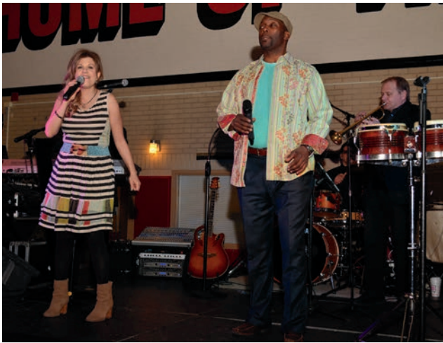
Music at Res Fest was provided by The Mix .