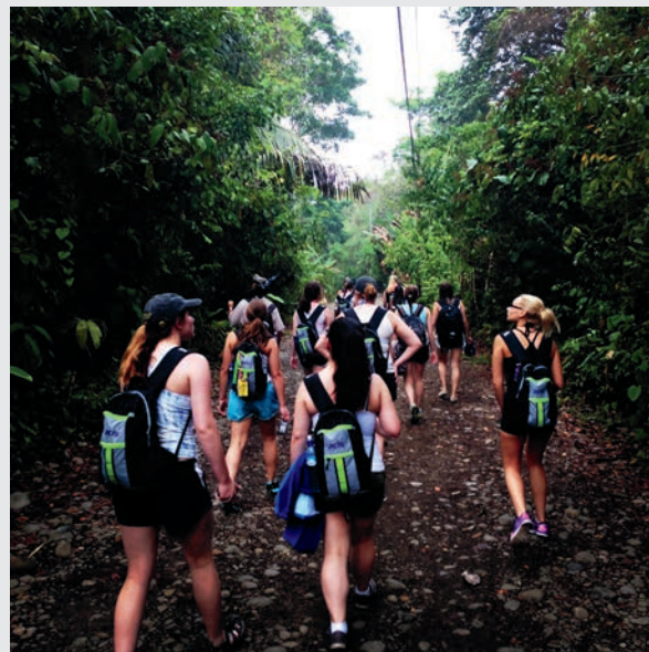
Fourteen Resurrection students traveled to Costa Rica over spring break for an educational trip that combined service and environmental conservation activities.