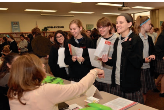
Students visit with alumnae during Alumnae Career Day.

Resurrection College Prep High School hosted the annual Alumnae Career Day on February 1, 2014. Alumnae shared information about their educational and career paths while current Resurrection students had the opportunity to explore various career choices.