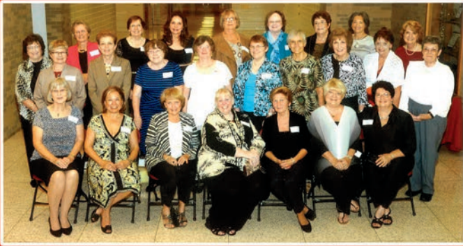
Class of 1964 50 th Reunion on September 27, 2014