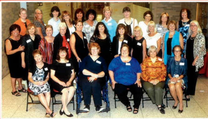
Class of 1974 40 th Reunion on September 20, 2014