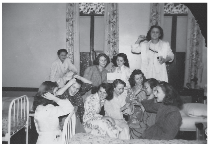
Boarders learned to set their hair in pin curls or rollers from the older girls they lived with in the dormitories.

We had a daily schedule, which included getting up in the early morning, dressing, making our beds, washing, having breakfast in the refectory, and going to classes. After school we changed from our uniforms into our play skirts and smocks, had a piece of fruit, and played outdoors. In winter, we ice skated in the flooded portion of the huge playground. In the warm weather, we tired ourselves out on plank swings, high flyer maypole twisters, and tall slides. Though largely unsupervised and free of contemporary "safety restrictions," during all our years at Resurrection Academy, to our knowledge, there were no accidents from indoor or outdoor activities. After playtime, we ate dinner, did our homework, and were in bed about 8:30 pm.