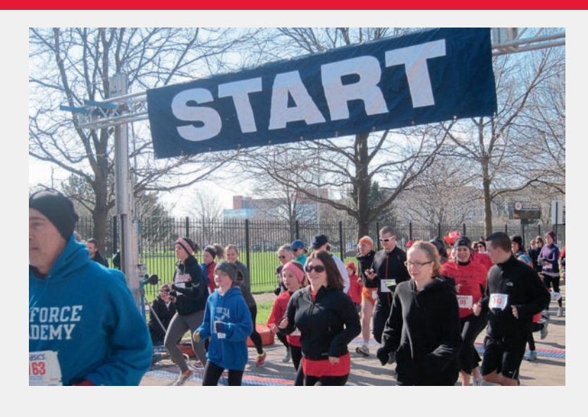
Run for Res 2013 - April 20, 2013