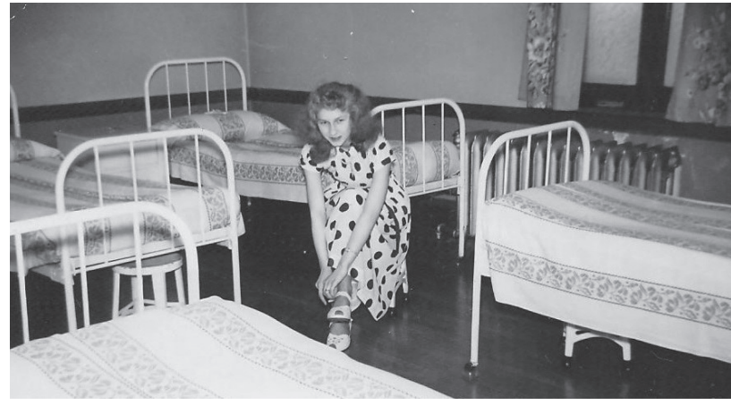
Students who boarded at Resurrection Academy lived in dormitories and developed life long friendships.