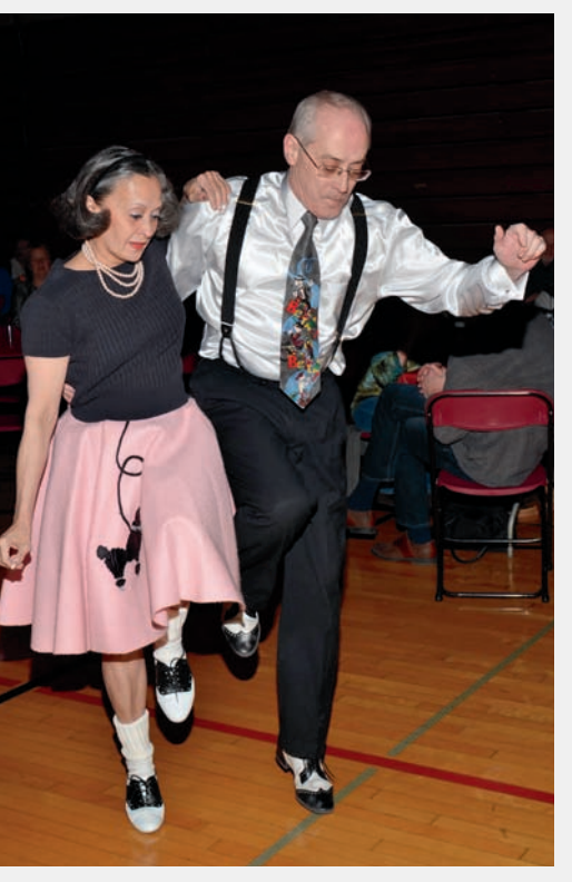
Res Fest 2013 February 16, 2013