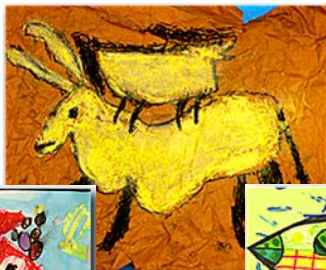
CAVE ART Second Grade