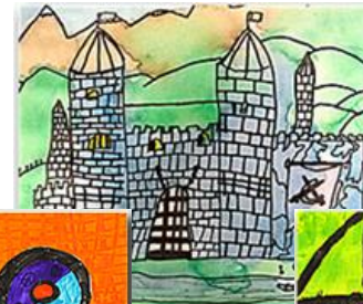
M.C. ESCHER'S Fourth Grade