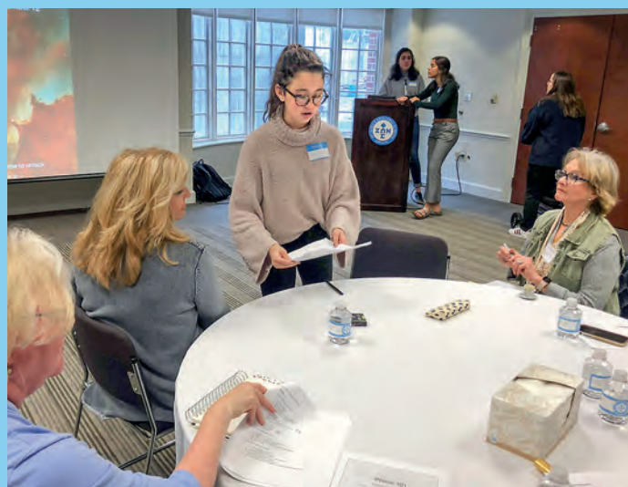
Alumnae receive tips at the Smart Phone 101 training session from the Beak Squad, a group of Upper School technology students.