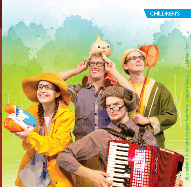
from We're Going on a Bear Hunt by Michael Rosen