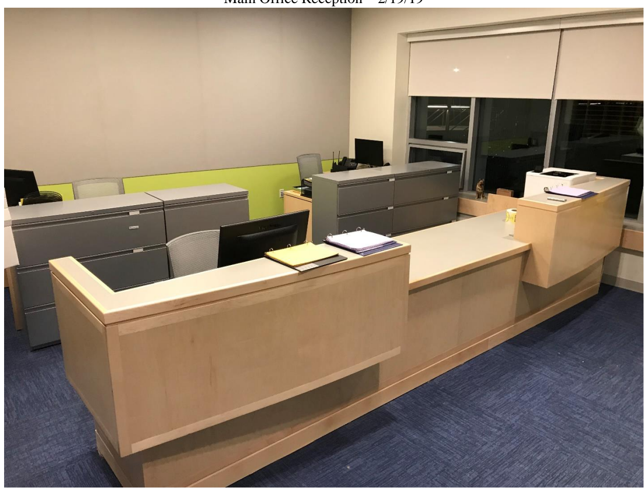
Visit our website: www.greenwichschools.org/NLSBC