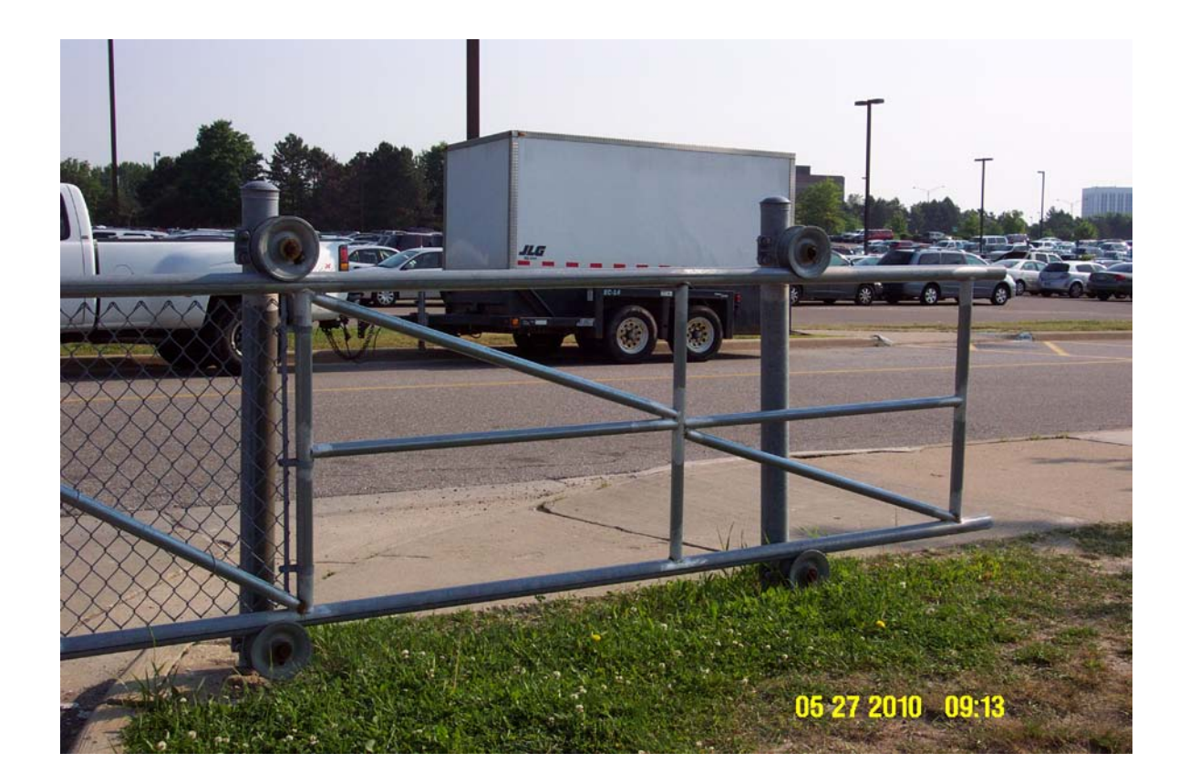
Located at Troy High School – Stadium Parking Lot