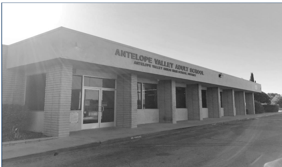
Antelope Valley Adult Education's Lancaster campus, on 3 rd Street East, South of Avenue I

- U.S. Census Bureau 2013 American Community Survey