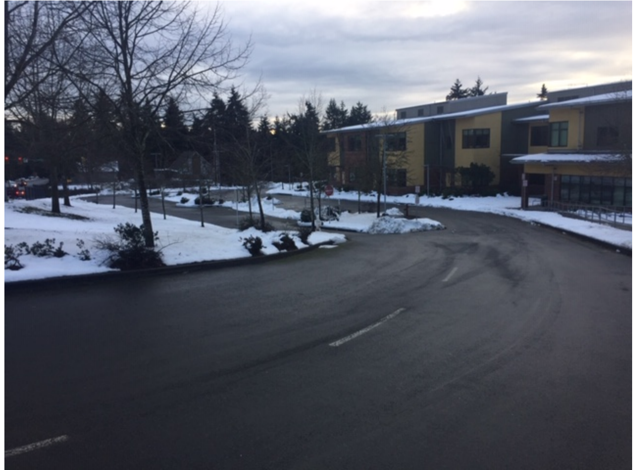
Juanita El. - Fri 2/15