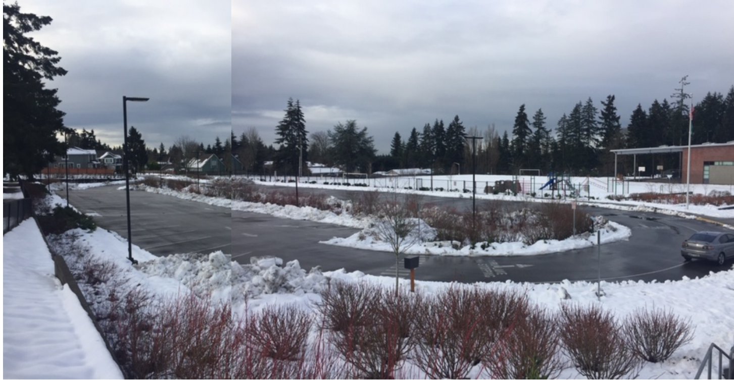
Sandburg El. - Fri 2/15