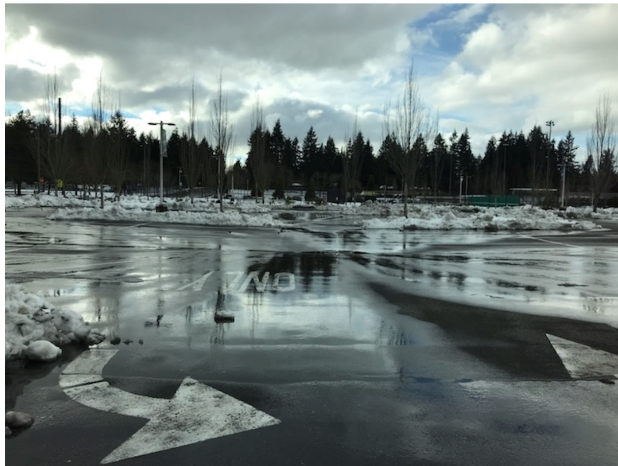
Redmond HS - Fri 2/15