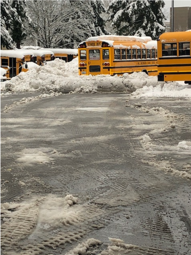
Bus Lot Tues 2/12