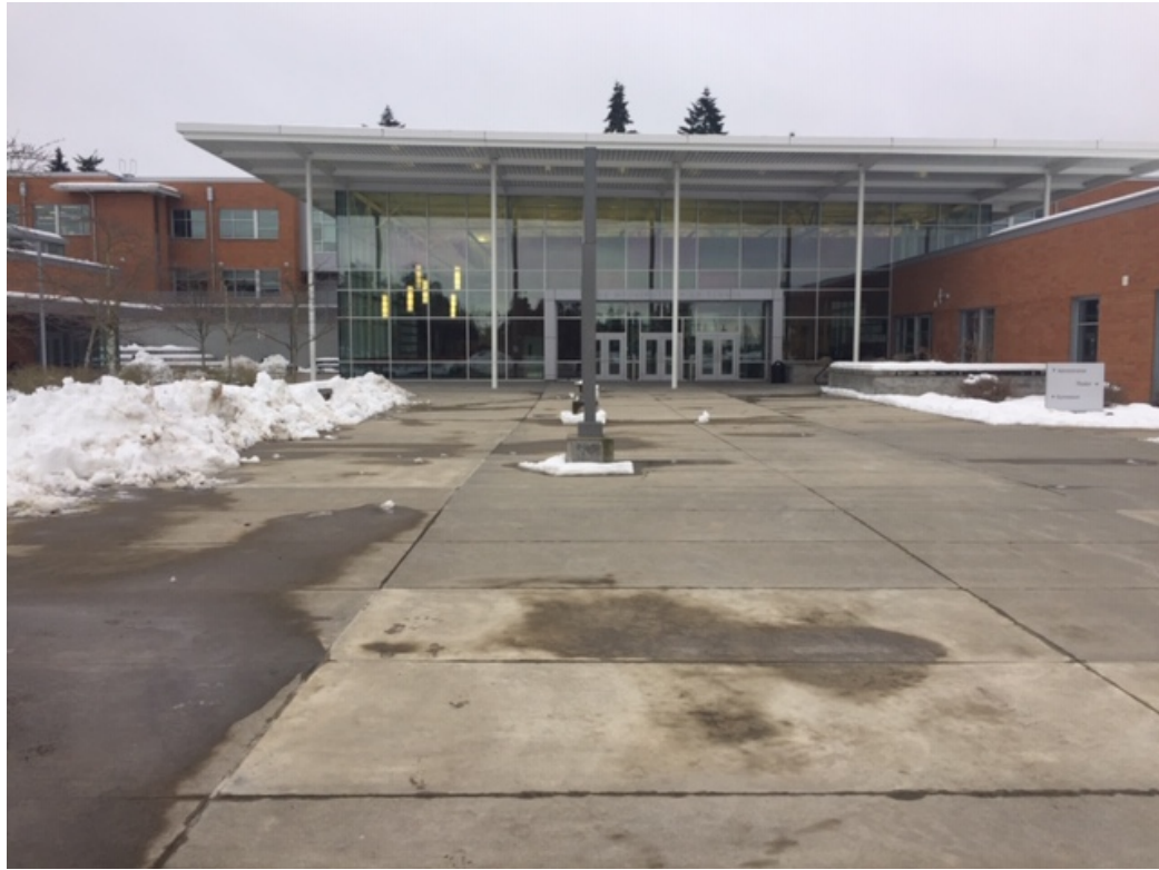
Lake Washington HS entrance – Fri 2/15