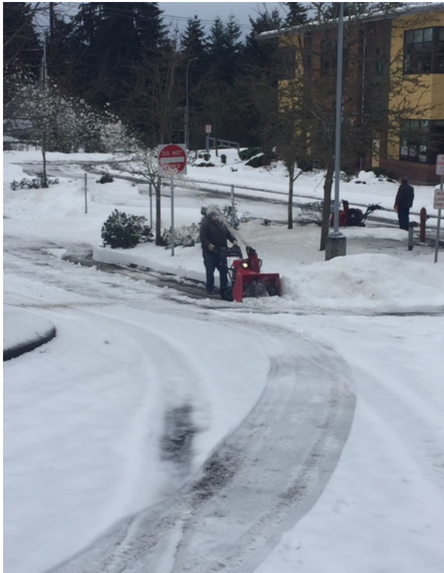
Juanita El. - Thu 2/14