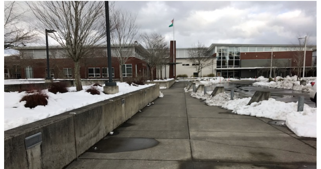
Redmond HS Fri 2/15