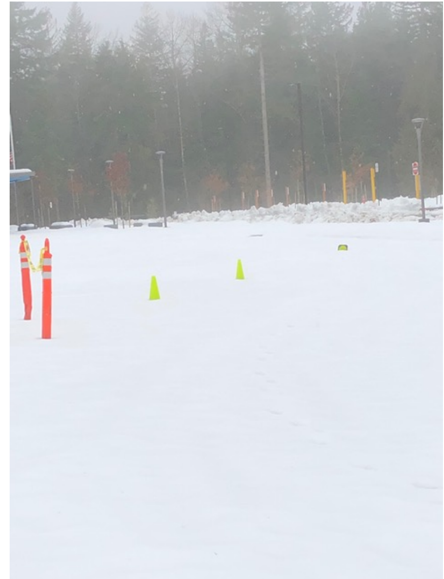
Baker El. bus loop – Fri 2/15