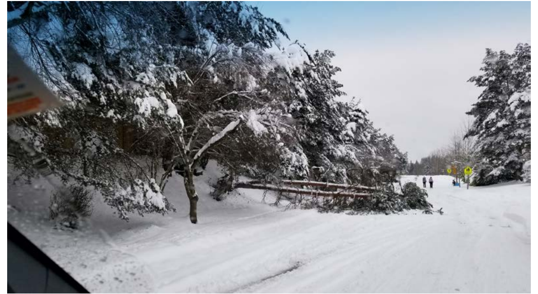
Smith El. Tues 2/12