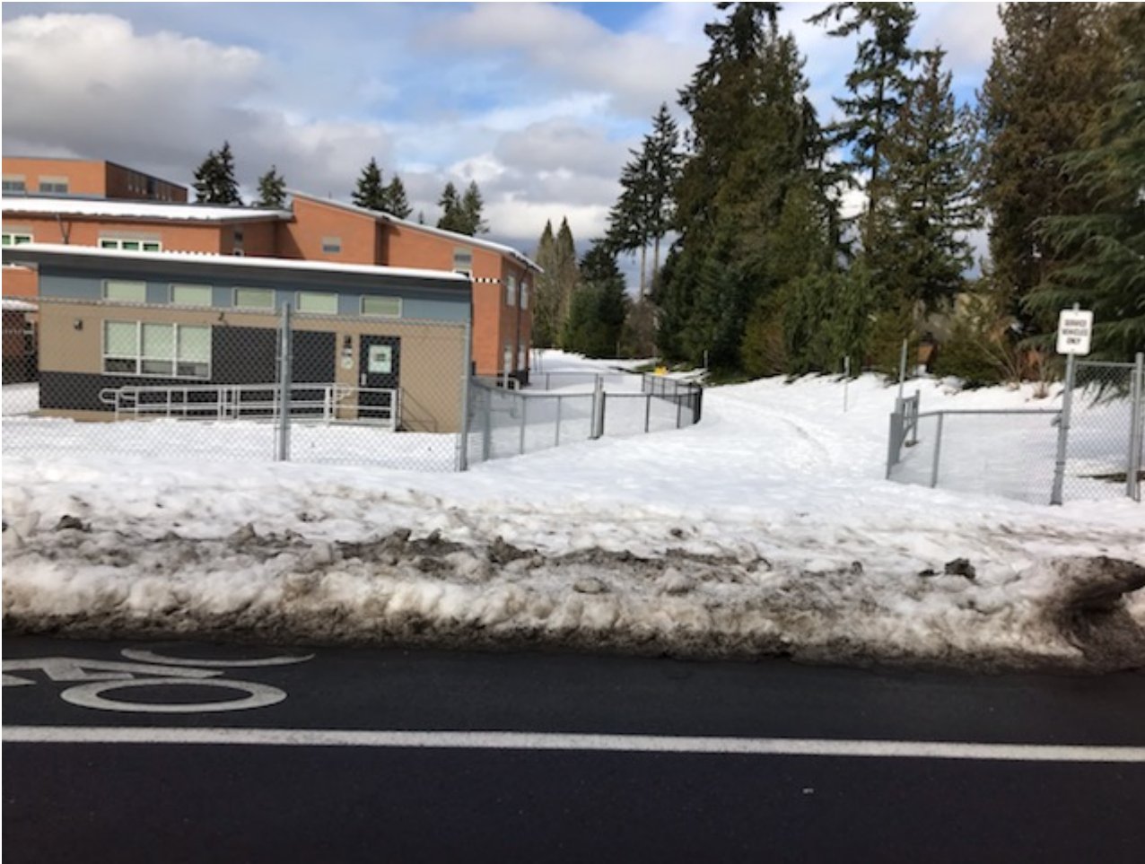
Rose Hill El. – Fri 2/15