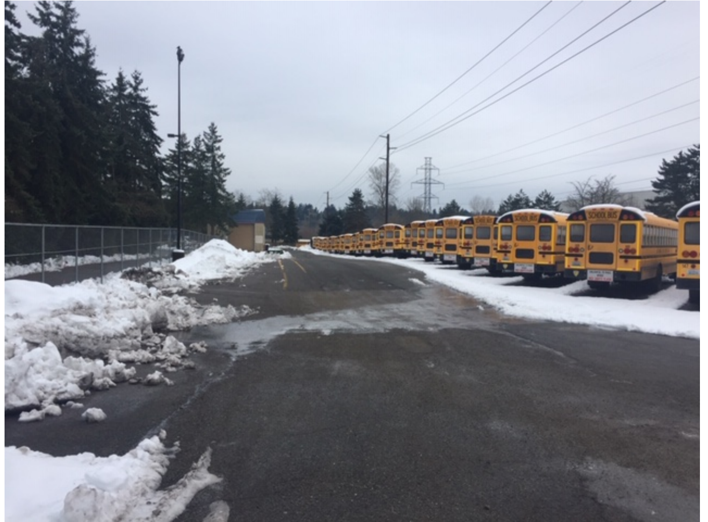
Bus Lot Thu 2/14