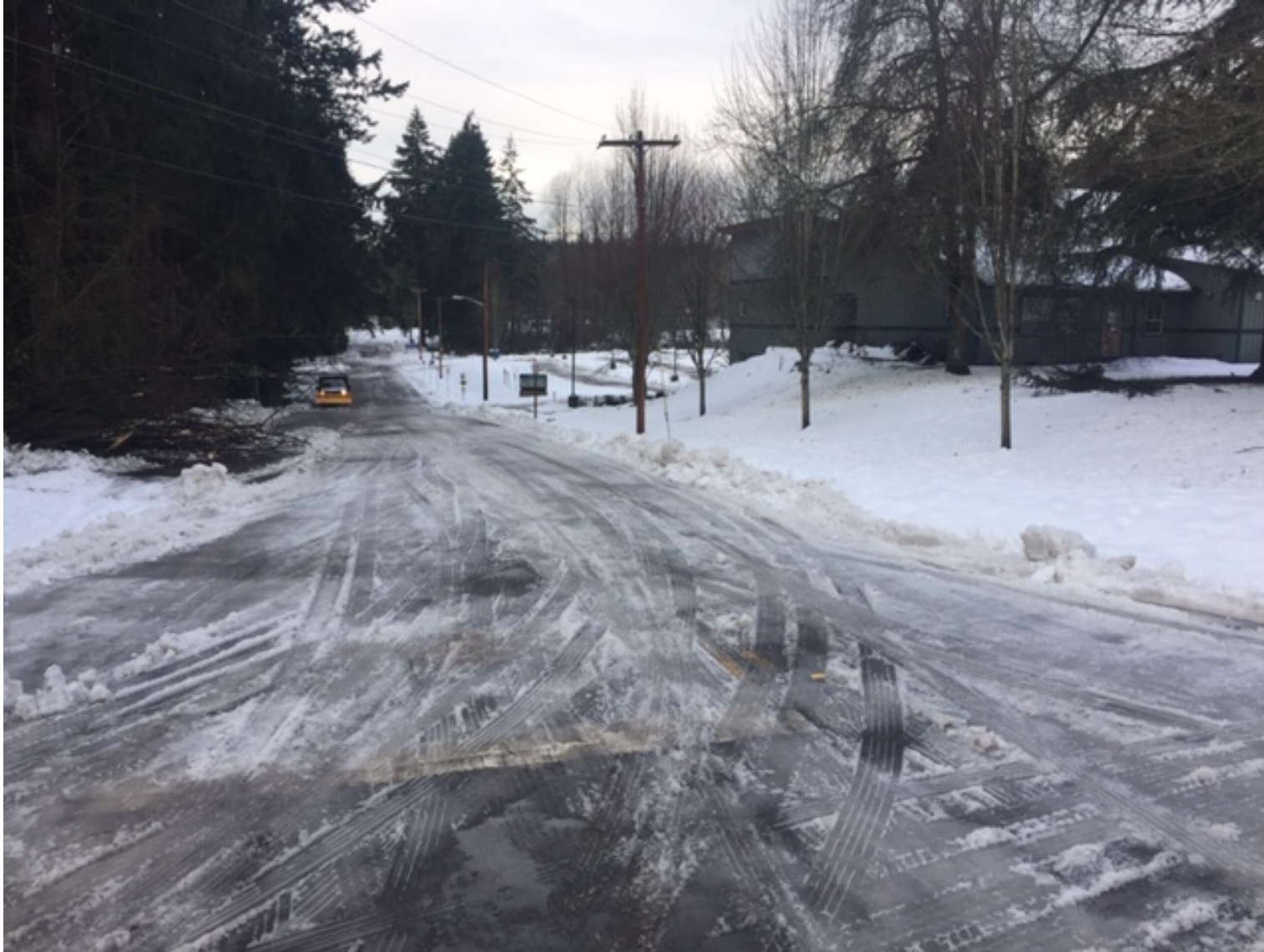
Thoreau El. Fri 2/15 NE 138 th St. (plowed by LWSD)