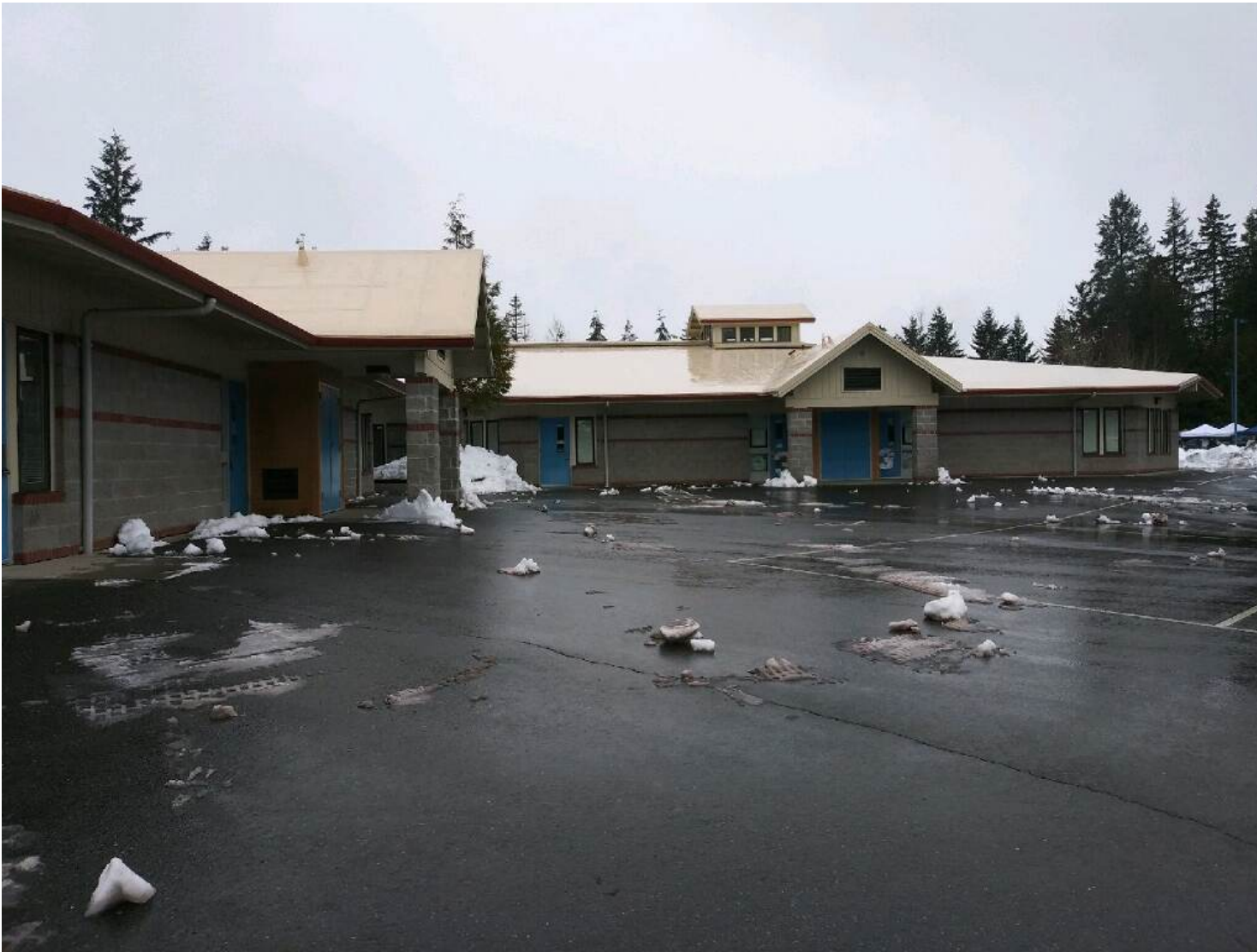
McAuliffe El. Sun 2/17