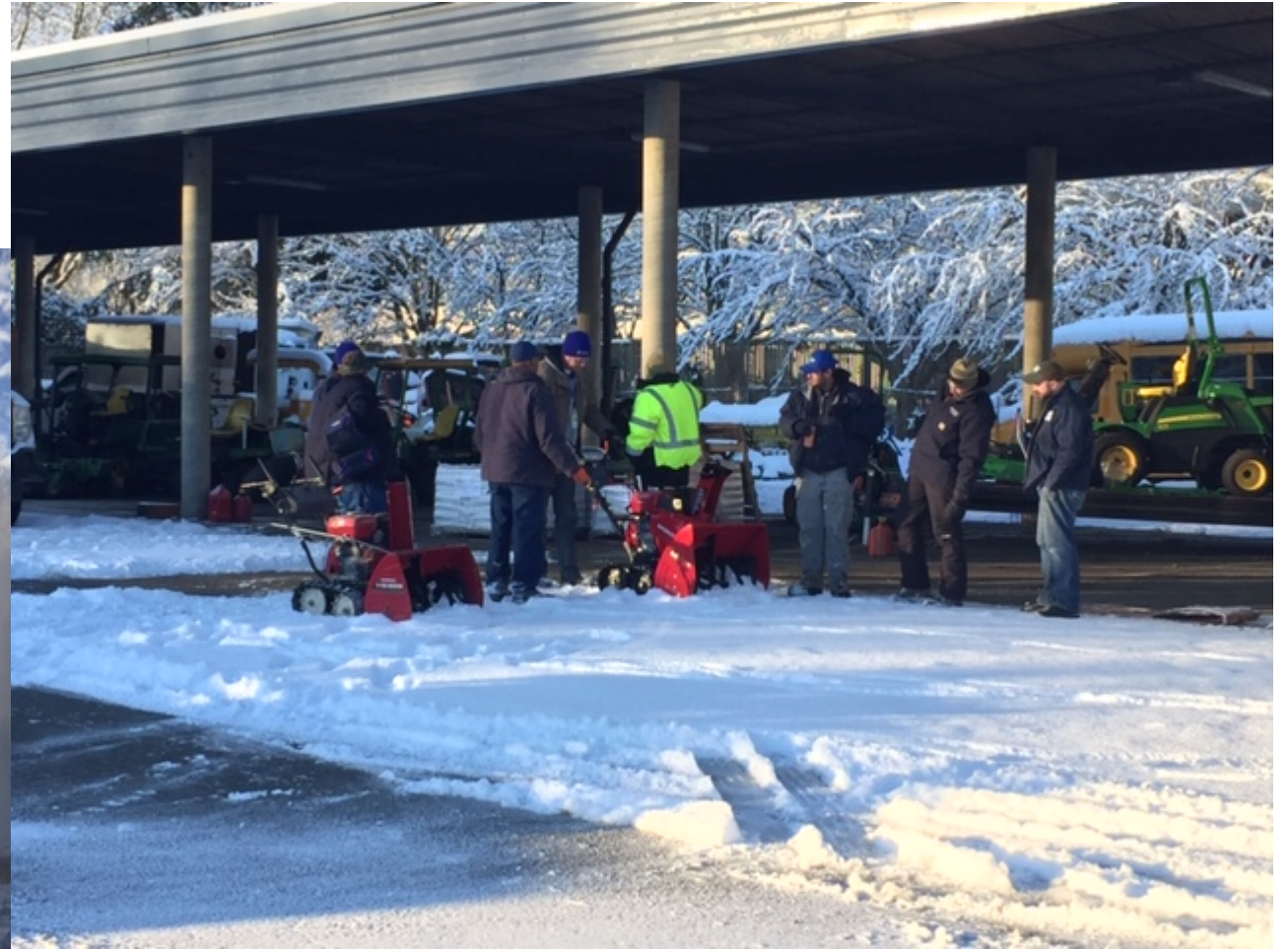
Our outstanding staff!