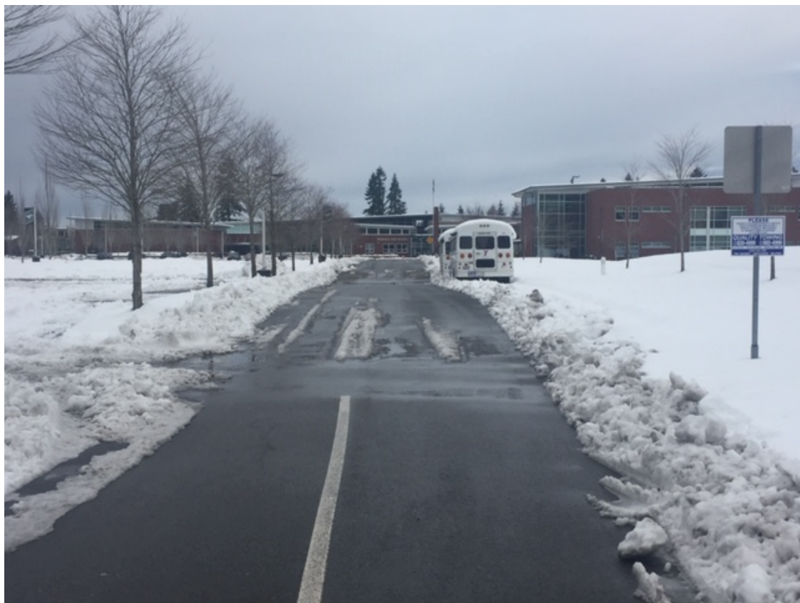
Redmond HS - Thu 2/14