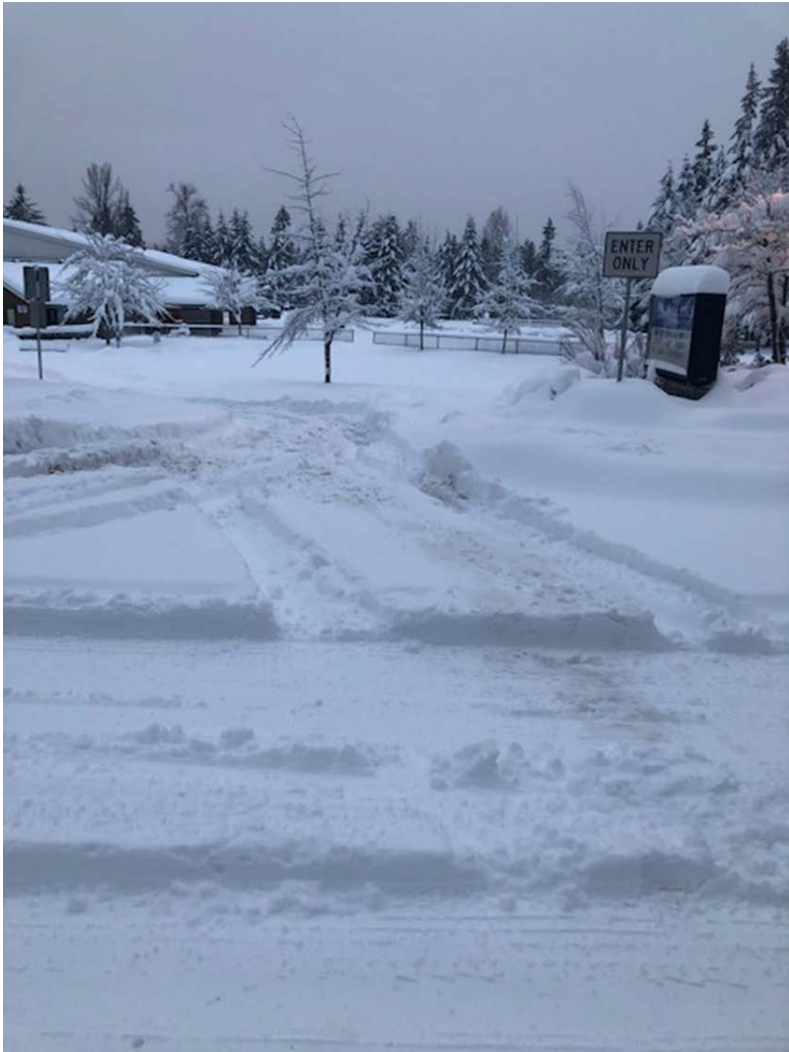
Wilder El. Tues 2/12