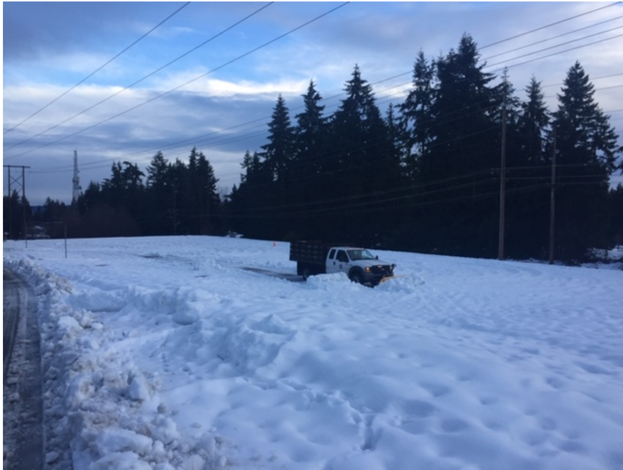
Rose Hill MS Parking – Fri 2/15