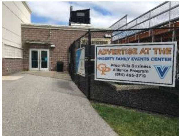
Gym Banner 5' (W) x 3' (H)