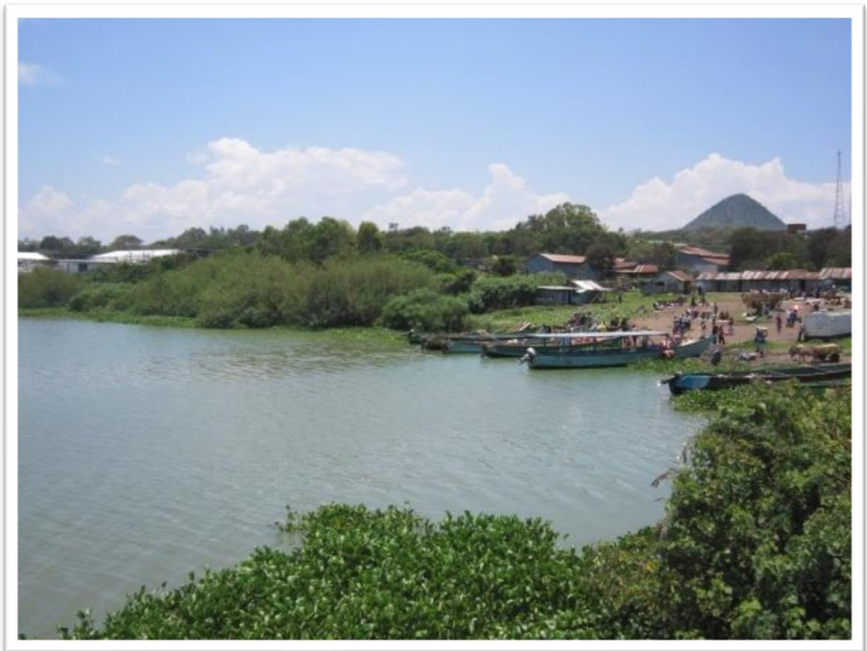
Homa Bay, Kenya