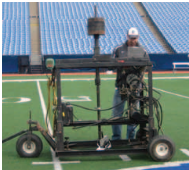
Figure 2. We test traction using Pennfoot - a device that allows us to compare traction levels on playing surfaces using various types of shoes.

generation of synthetic turf is released, consumers will benefit by having more access to scientific research, allowing them to make more informed decisions. •