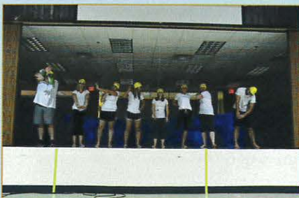
Shabonee staff kicked off the year with a parody of a synchronized swim team routine.

Shabonee School was recognized by the Positive Behavioral Interventions and Support (PBIS) network for achieving Platinum status this fall. This is the highest acknowledgement that can be earned by the PBIS network for implementing all aspects of the PBIS system with fidelity.