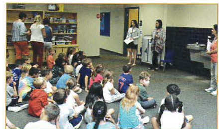
Hickory Point students learned about proper behavior in the bathrooms and at the drinking fountain.

Hickory Point implements Positive Behavior Interventions and Supports (PBIS). PBIS is a proactive systems approach to establishing a continuum of behavioral supports to meet the needs of all students and improve the social culture at school. Teaching and reinforcing expected behaviors and providing positive feedback throughout the school day accelerates the academic, social- emotional outcomes for all students. Hickory Point students are learning about BARRK ("Bulldogs Are Respectful, Responsible and Kind."