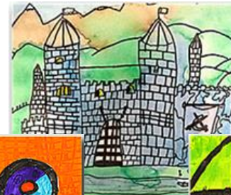
M.C. ESCHER'S Fourth Grade