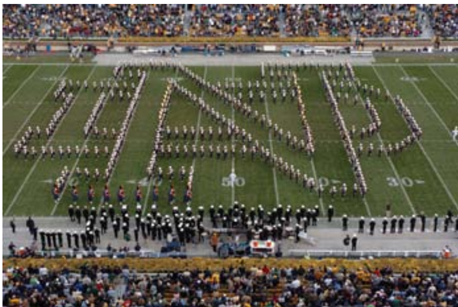
Notre Dame completed their season with a perfect record.