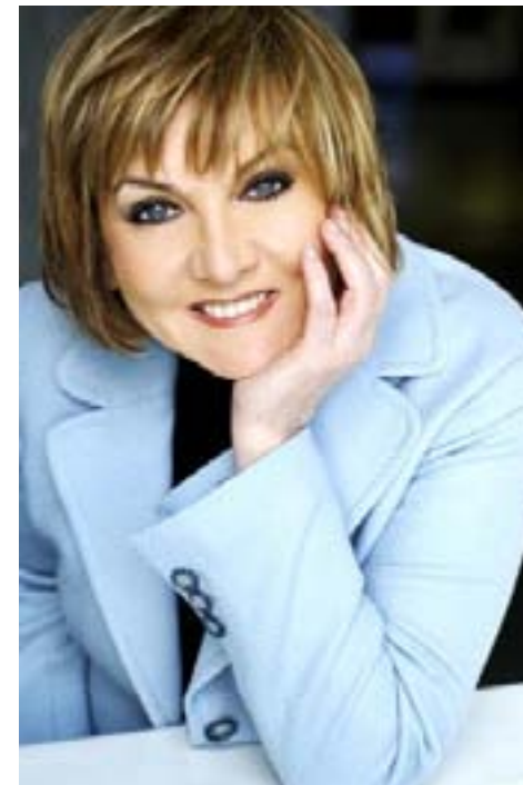
Designer Sherri Hill