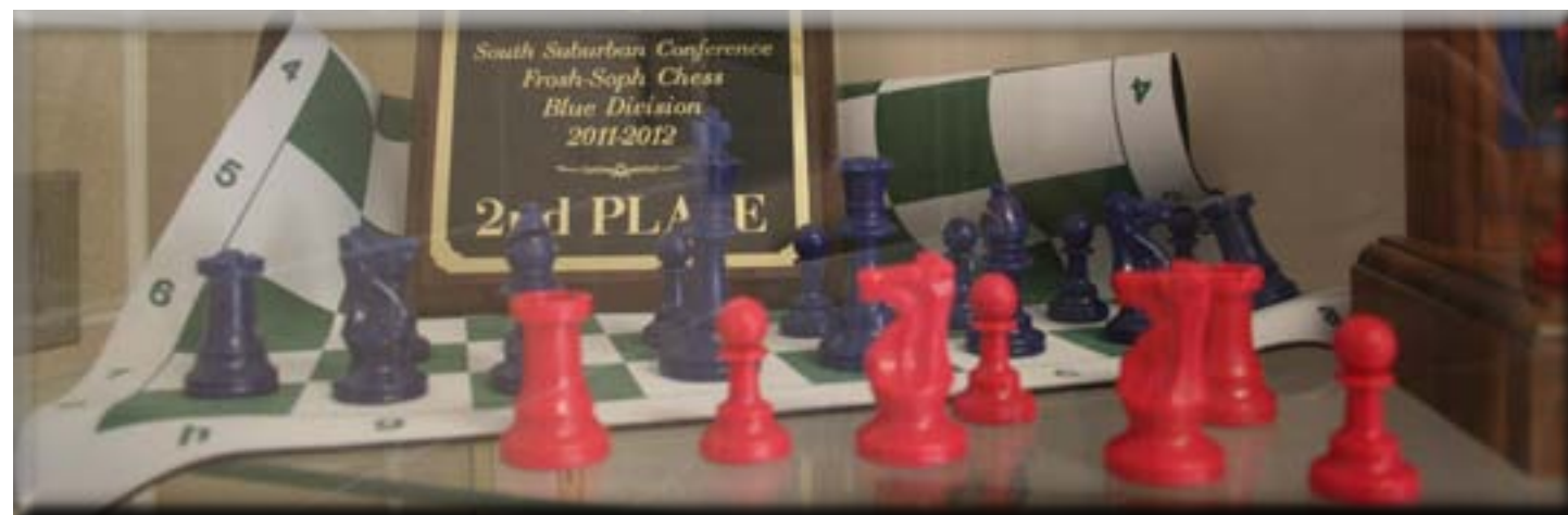
The chess club won second place in their division in the 2011-2012 season.