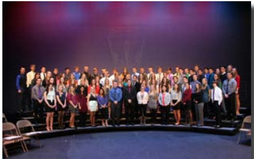
Current members were re-inducted as well.