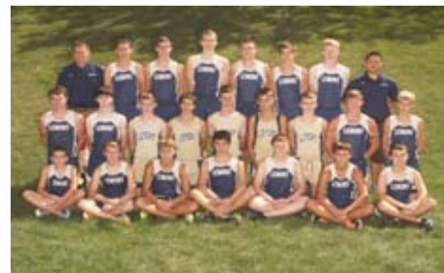
Boys and Girls cross country teams

Don’t count out fall sports yet. Boys/girls cross country team are getting closer to State. Hard work and determination are being achieved. And this season is a memorable not just for seniors but for all the runners on the boys/girls cross country team with taking home conference for the first time in over twenty years.