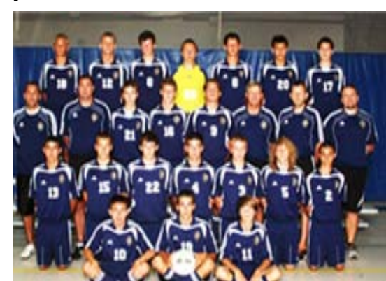
Lemont Varsity Soccer team