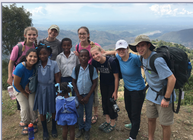
STUDENTS AND FACULTY IN HAITI

Thayer society donors provided important support for students participating in a broad array of trips and exchange opportunities offered through our Global Citizenship Initiative. Traveling more than 528,000 miles, 74 students (accompanied by 16 faculty members) participated in 12 programs across Europe, Australia, South America, and beyond. Through these experiential learning opportunities, students acquired intercultural knowledge, appreciated cultural differences and fostered a commitment to serving others.