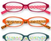
Clipart of glasses

Your VSP Frame benefit offers you the freedom to choose from a wide selection of frames that complement your life-style.