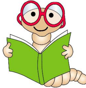
Clipart of bookworm